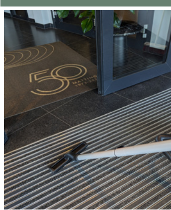
1. Vacuum cleaning.